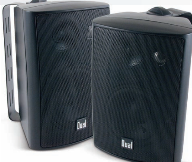
LU43PB Indoor/Outdoor Speakers - Black

Dimensions: 8.25" h x 5.25" w x 5.25" d Sold as a pair